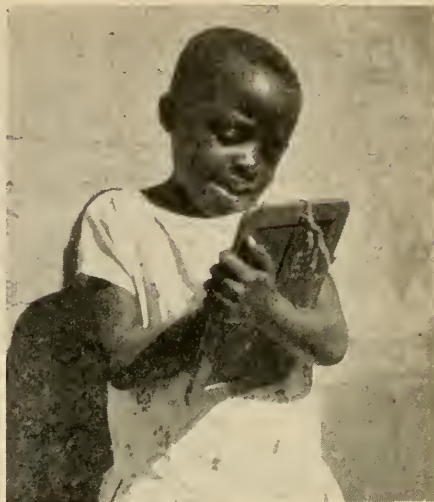
(Left) In Kambini, a nurse and assistant care for a youthful patient. (Right) At Salisbury, Southern Rhodesia, a certain young person is pleased with her writing

"That the government should consider establishing in the State Department a separate division with most of its personnel having African experience, to deal with African-American affairs, since the system of the 'past, by which Africa has been dealt with as part of the work of the Near East Division or of the West European Division, seems inadequate for the present and future."